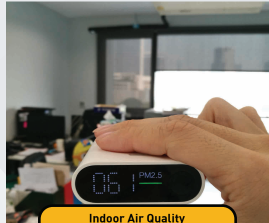
Indoor Air Quality Inspection and Testing