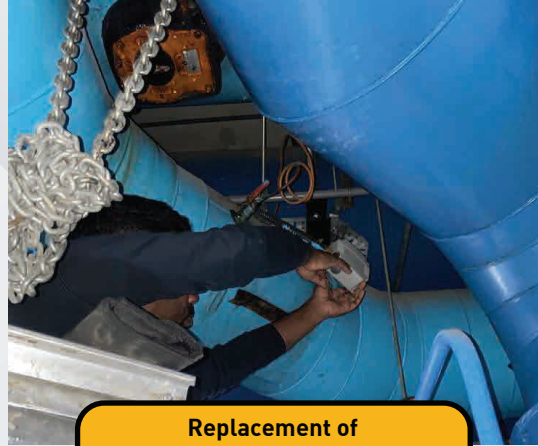
Replacement of AHU sensors and testing