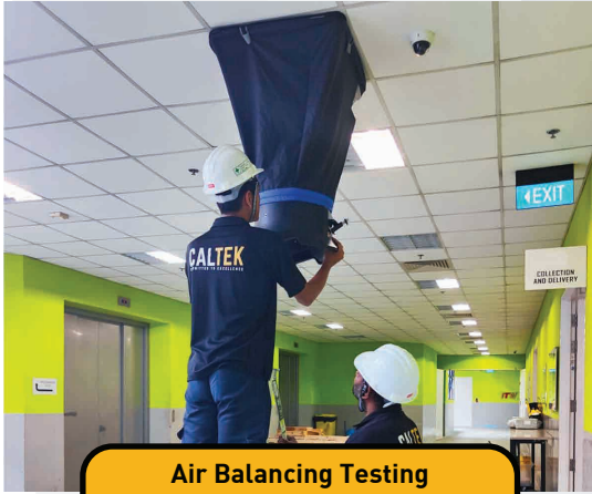
Air Balancing Testing & Commissioning